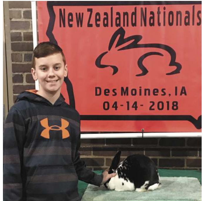
Youth Best Opposite Sex Austin Rummerfield ~ Broken 6/8 Buck (No pictures available at this time)